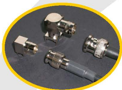
Mini and standard BNCs

Mounting styles and plating specifications to your requirements. Custom designs available in all ranges.