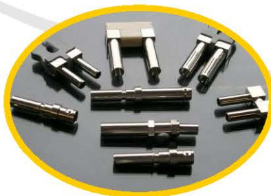
MUSA connectors and links