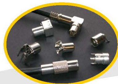
IEC / TV connectors