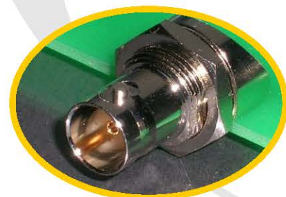
BNC edge mount