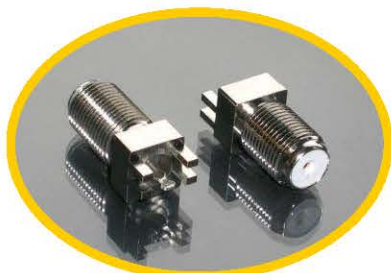
Edge mount F and high performance DPX version